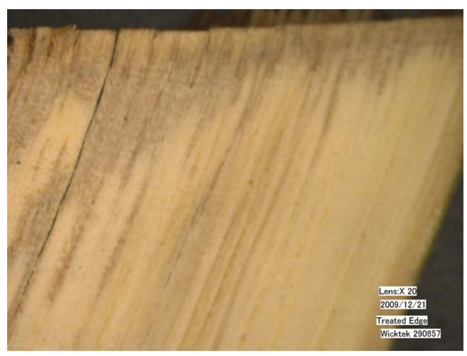
Treated Edge (unmeasured)